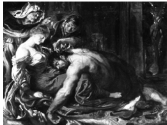
Samson & Delilah, by Rubens