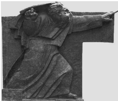
“Moses” by Ivan Mestrovic