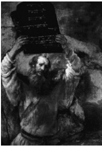
“Moses” by Rembrandt