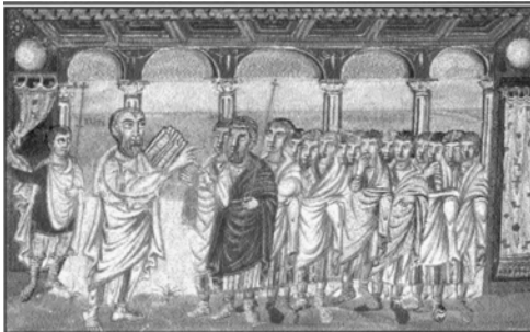
“Moses proclaiming law”, medieval miniature