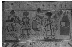
Mosaic from Beth Alpha synagogue, 6 th cent. CE