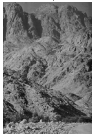
Gebel Musa (Mt. Sinai?)