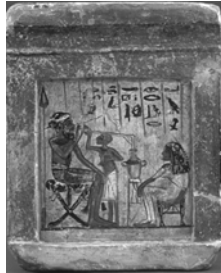
Asiatic's gravestone, ca. 1350 BCE