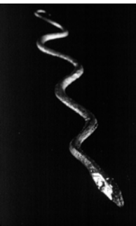
Copper snake, 13 th -12 th cents. BCE