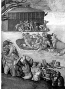
Michelangelo, Noah's Flood