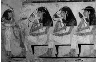
Egyptian grave painting, 15 th -14 th cents. BCE