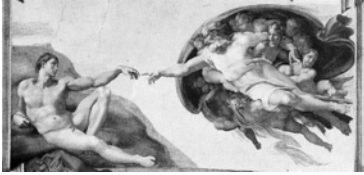
Michaelangelo, Creation of Adam