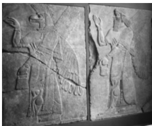
Neo-Assyrian reliefs (9 th -7 th cents. BCE)