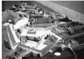
Model of ancient Pergamum