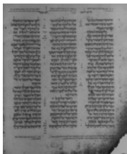
Aleppo Codex, 10 th cent. CE