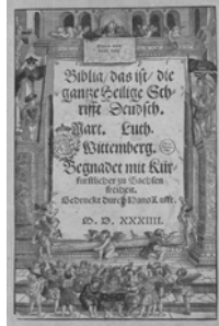
Martin Luther's Translation