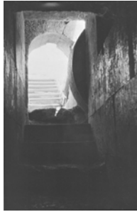
1 st cent tomb, Jerusalem