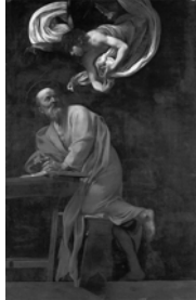
Caravaggio, "Inspiration of St. Matthew" 1602