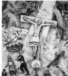
"White Crucifixion" by Marc Chagall (1938)