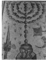
Synagogue mosaic, 300 CE