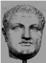
Titus (39-80 CE)