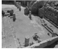
Synagogue at Herodium