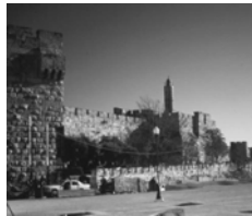
Jerusalem’s medieval walls