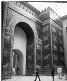
Ishtar Gate, Babylon