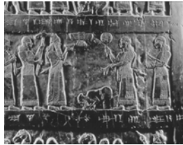
Israel's king bows before Assyrian king